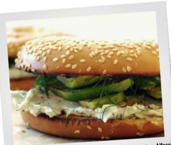
Bagel c/ Queijo Filadélfia, Tomate, Cebola Roxa, Abacate e Alface Bagel with Cream Cheese, Tomato, Red Onion, Avocado and Lettuce