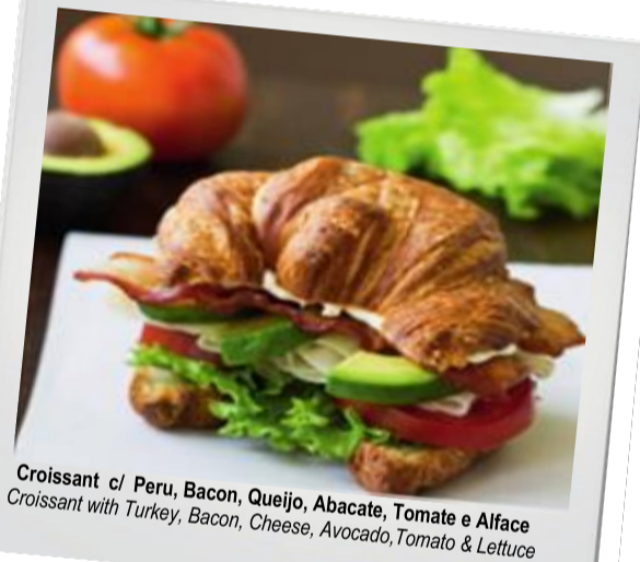
Croissant c/ Peru, Bacon, Queijo, Abacate, Tomate e Alface Croissant with Turkey, Bacon, Cheese, Avocado, Tomato & Lettuce